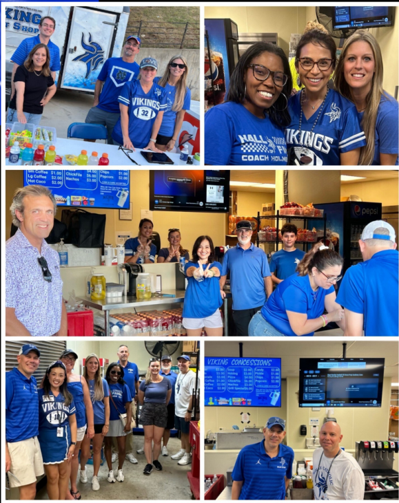
NCHS VIKING CLUB