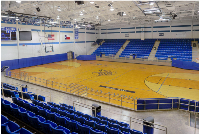
Before image of Hartnett Arena floor

We're excited to share that the floors in both Hartnett Arena and our gym are getting a fresh coat of paint! These improvements will enhance the look and feel of our athletic facilities, providing a vibrant and welcoming environment for our students and teams. The project is set to be completed in the coming weeks. Stay tuned for more updates.