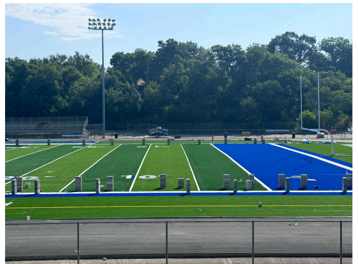
New field numbers!