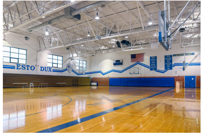
Before image of the Gym floor