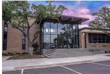
New Front Entrance