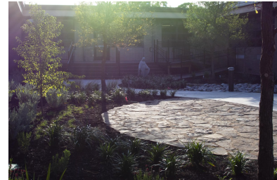
New Courtyard Landscapes