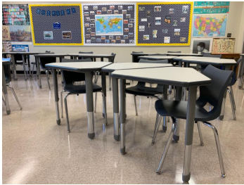
New Classroom Furniture

Please schedule a time to come visit and see all that is going on at Nolan Catholic.