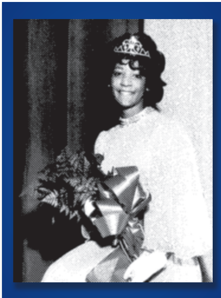
March 2021 #1