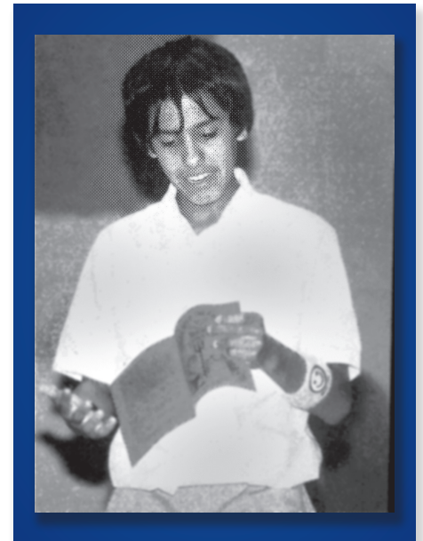
March 2021 #3