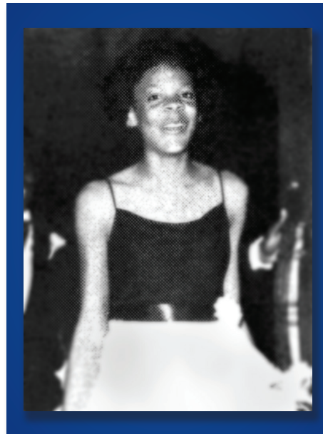
March 2021 #2