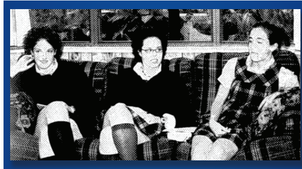
April 2021 #2