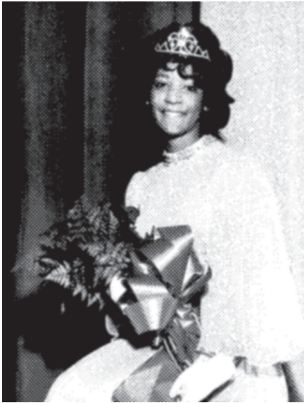
March 2021 #1