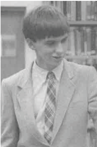
February 2021 #1