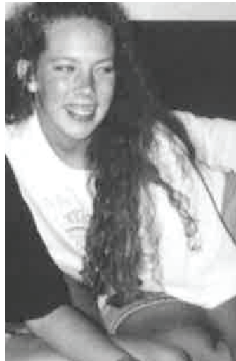
February 2021 #2