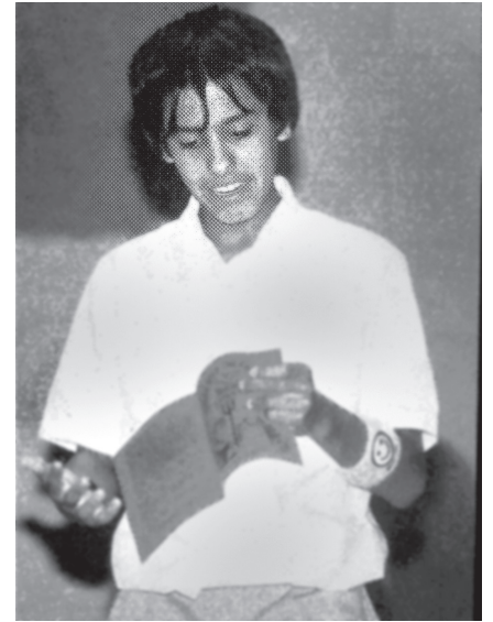
March 2021 #3