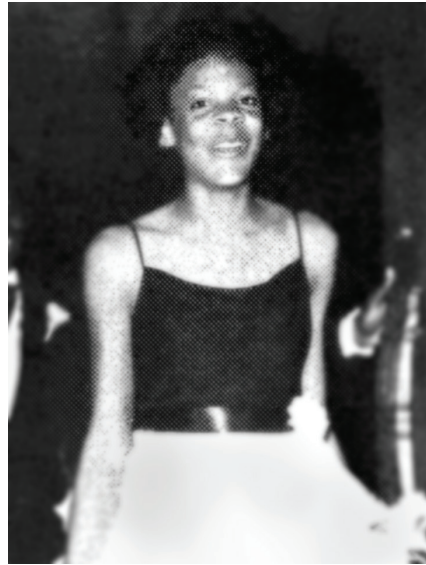
March 2021 #2