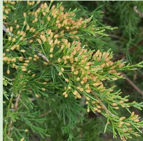
Male cedar with flowers

These trees rely on the wind (instead of animals or insects) for pollination, so they do not expend energy on making attractive or fancy flowers. Female eastern red cedars have tiny yellow flowers. When I went back down to the lake to look for female flowers, I found tiny buds at the leaf tips. It will be fun to watch these develop over the coming weeks!