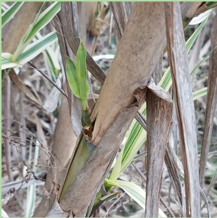
New growth among the reeds by the lake

From the creation, learn to admire the Lord! Indeed the magnitude and beauty of creation display a God who is the artificer of the universe. He has made the mode of creation to be our best teacher."