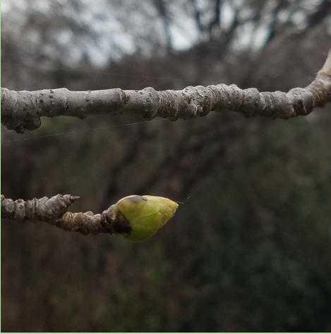
Leaf bud on the sweet gum tree by the convent