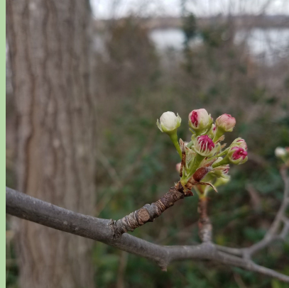
I guess we'll have to wait for full flowers and leaves to identify this tree!