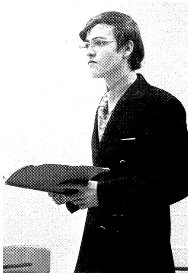
January 2021 #1