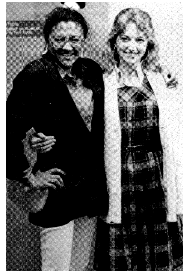
January 2021 #3